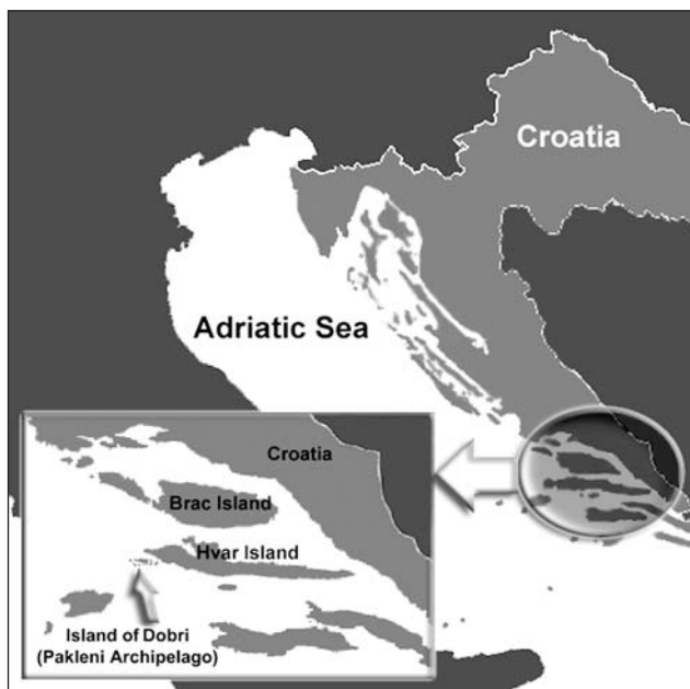
Fig. 1. Map of the study site, where the specimens of H. jeffreysianus were found.

Fig. 1. Ubicazione dell'area da cui provengono gli esemplari di H. jeffreysianus .