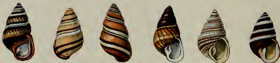
7 7a 7b 8 9 10